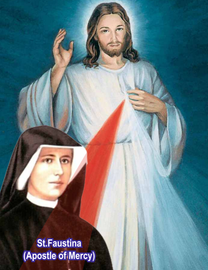
St. Faustina (Apostle of Mercy)